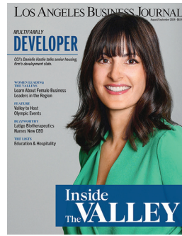
Art Deadline: July 23

SPECIAL FOCUS Women's Leadership EVENT Valley Women's Leadership Awards & Symposium Week of August 18 ( tentative ) (Content Due July 18) SPECIAL SECTIONS Insurance Roundtable Leaders to Know: Health Care (Content for Both Due July 11) THE LISTS Colleges & Universities, MBA Programs, Hospitals