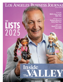
Art Deadline: Nov. 24