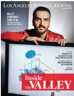
Art Deadline: March 19

SPECIAL FOCUS Real Estate EVENT Valley Commercial Real Estate Awards April 10 ( tentative ) (Content Due March 14) SPECIAL SECTIONS Health Care Roundtable MBA/Master's Guide (Content for Both Due March 7) THE LISTS Law Firms, Insurance Brokers, Hotels, Meeting Facilities