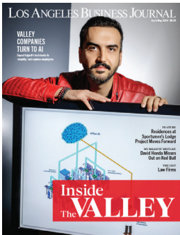
Ad Materials Due: March 19

SPECIAL FOCUS Real Estate EVENT Valley Commercial Real Estate Awards April 10 (tentative) (Content Due March 14) SPECIAL SECTIONS Health Care Roundtable MBA/Master's Guide (Content for Both Due March 7) THE LISTS Law Firms, Insurance Brokers, Hotels, Meeting Facilities