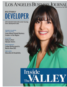
Ad Materials Due: July 23

SPECIAL FOCUS Women's Leadership EVENT Valley Women's Leadership Awards & Symposium Week of August 18 (tentative) (Content Due July 18) SPECIAL SECTIONS Insurance Roundtable Leaders to Know: Health Care (Content for Both Due July 11) THE LISTS Colleges & Universities, MBA Programs, Hospitals