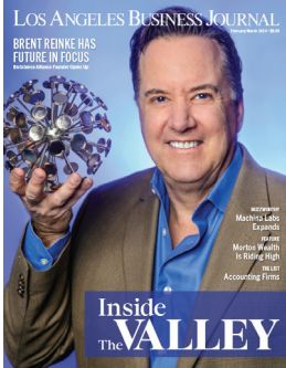
Art Deadline: February 5

SPECIAL FOCUS Economy & Finance EVENT Valley Economic Trends Week of February 24 (tentative) (Content Due Jan. 31) SPECIAL SECTIONS Labor & Employment Roundtable Leaders to Know: Trusted Advisors (Finance, Accounting, Law, Insurance) (Content Due Jan. 24) THE LISTS Accounting Firms, Chambers/ Business Organizations