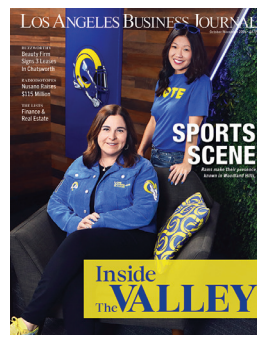
Art Deadline: Sept. 24

SPECIAL FOCUS Small Business EVENT Small Business Roundtable & Awards Week of October 27 (tentative) (Content Due Sept. 19) SPECIAL SECTIONS Giving Guide Leaders to Know: Real Estate Valley Economic Alliance (Content Due Sept. 12) THE LISTS Commercial Real Estate Brokerages, Banks, Credit Unions, SBA Lenders