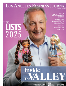
Art Deadline: Nov. 24