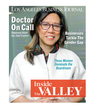
Ad Materials Due: Aug. 30

THE LISTS Accounting Firms, Chambers/ Business Organizations