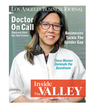
Ad Materials Due: Aug. 30

THE LISTS Accounting Firms, Chambers/ Business Organizations