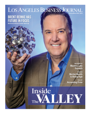
Art Deadline: March 5